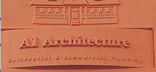
Elegant corporate ID signs