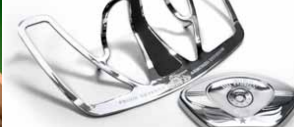
Chrome motorcycle accents