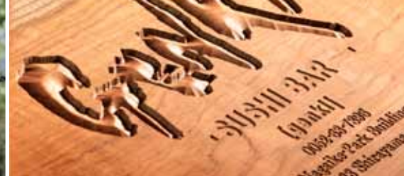
Routed wooden signs

Power, precision and performance come standard. Roland EGX Pro engraving machines have the power, size and speed professional engravers want. In addition to customizing awards, plaques, name plates, apparel and promotional items, these benchtop devices are perfect for producing quality indoor and ADA-compliant signage. Your braille and pictographic signs will have an upscale look while meeting all ADA regulations.