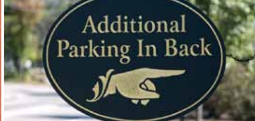
Retail & directional signs